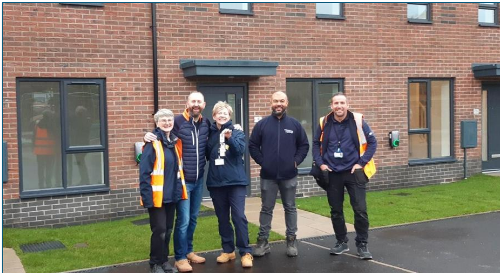
Officers on site taking handover of the milestone 750 th home on Carder Way, Waverley.