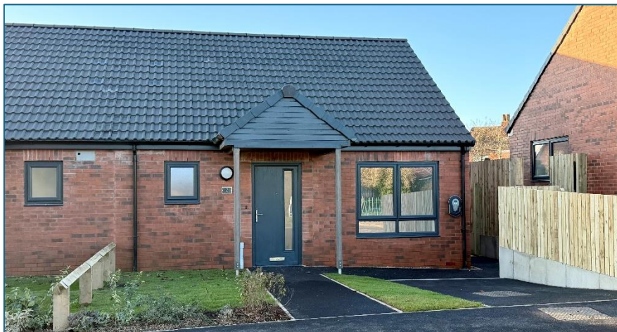
New home at Swinton.