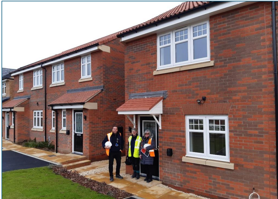
Officers on site taking handover of new homes in Dinnington.