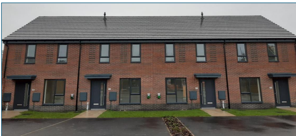
4x New Homes at Waverley, this includes the milestone 750 th new home.